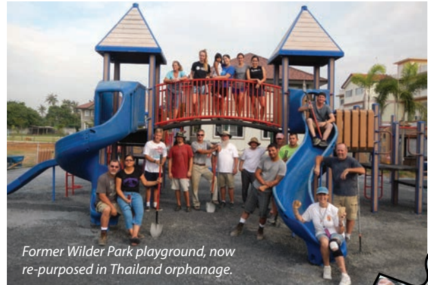
Former Wilder Park playground, now re-purposed in Thailand orphanage.

ensure continued maintenance and investment in the existing infrastructure. This includes identifying the operating and maintenance costs for proposed new facilities and developing plans for replacement of existing assets.