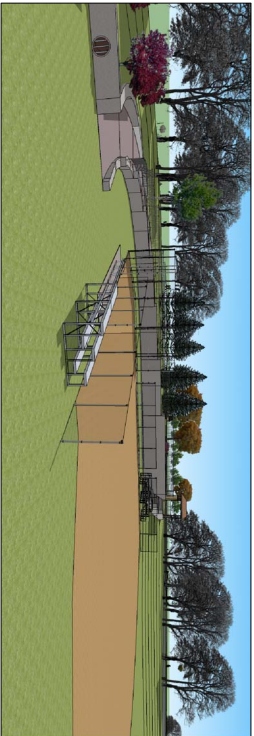
View from softball field looking west