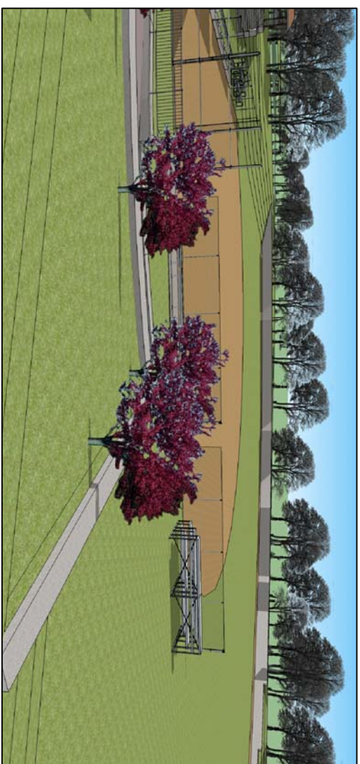
View from behind backstop looking towards outfield retaining wall