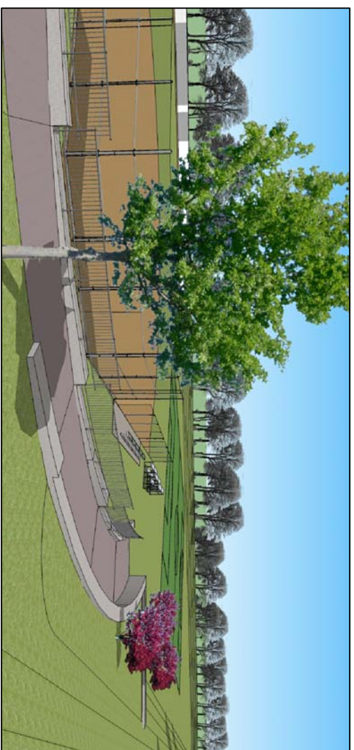
View from access ramp looking east