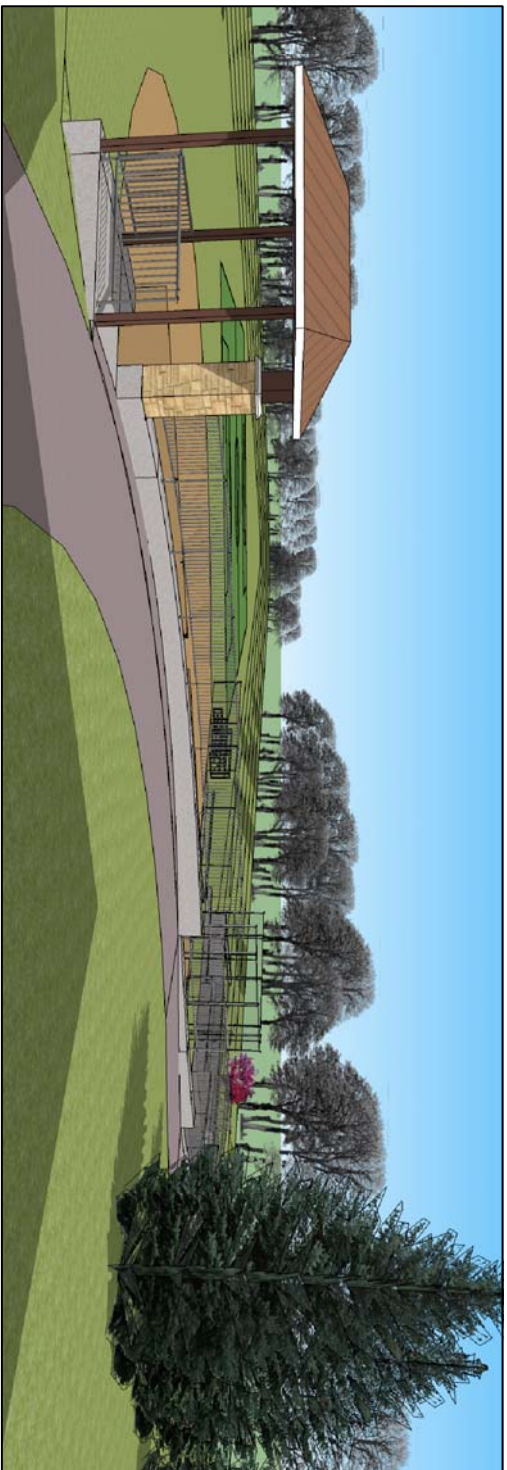
View from playground approaching softball field looking east