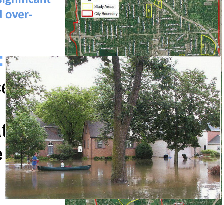
Courtesy of Elmhurst.Patch.com/Morrow Family Map of 10 Study Areas, April 2012 CBBE Report