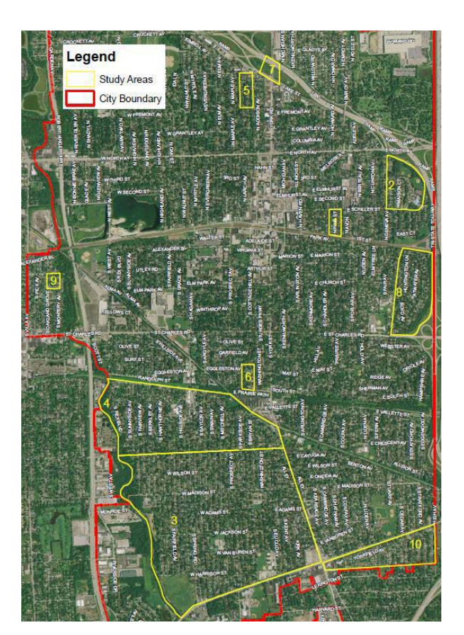
Map of 10 Study Areas, April 2012 CBBE Report