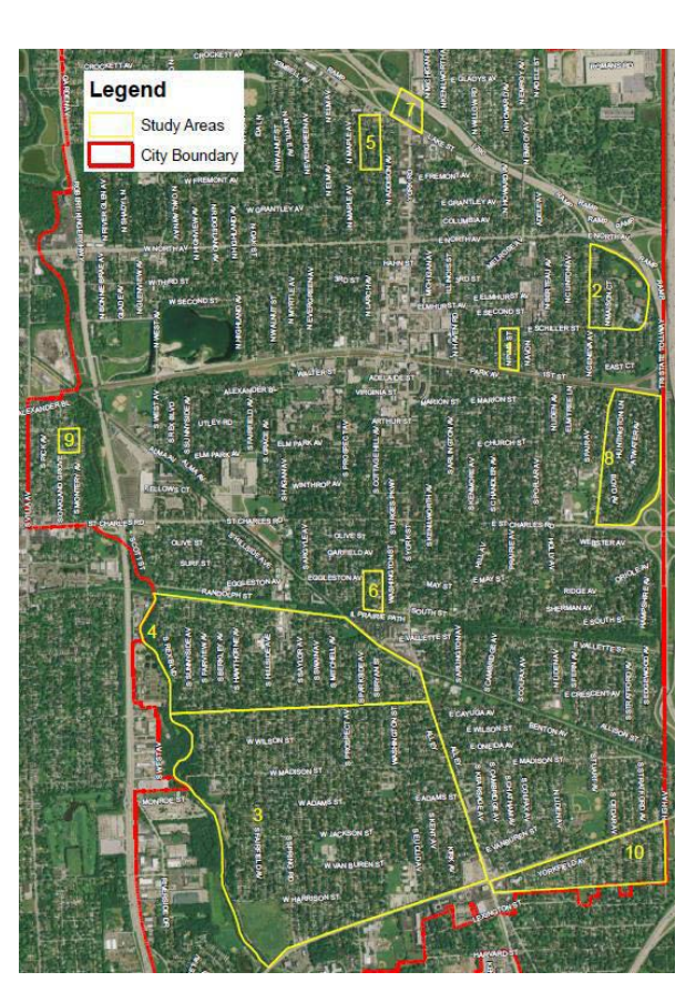
Map of 10 Study Areas, April 2012 CBBE Report