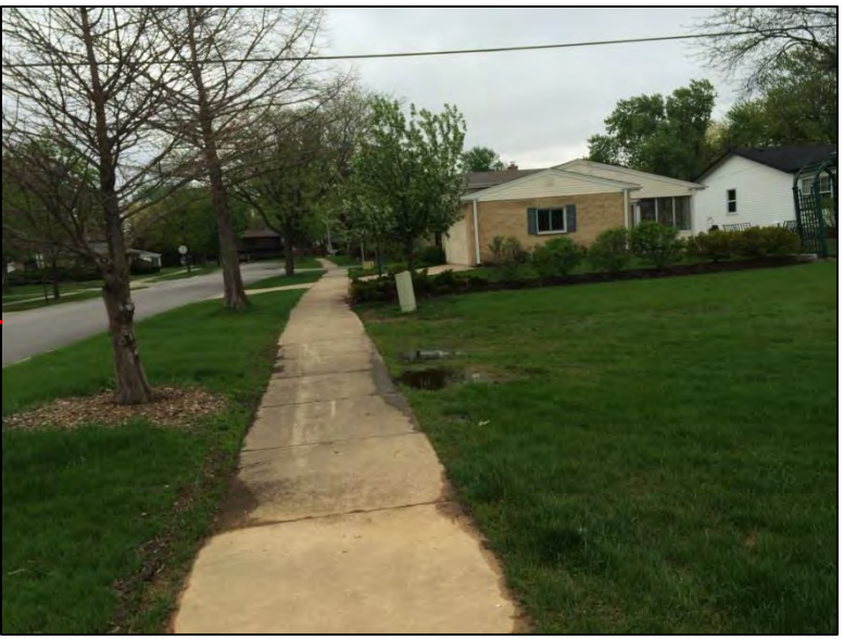
Drainage route over sidewalk