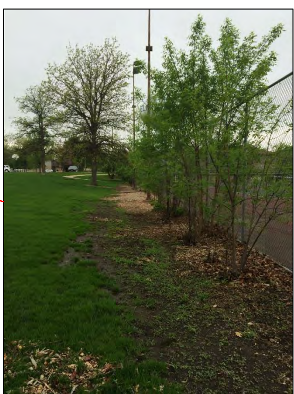
Field drainage into tennis courts