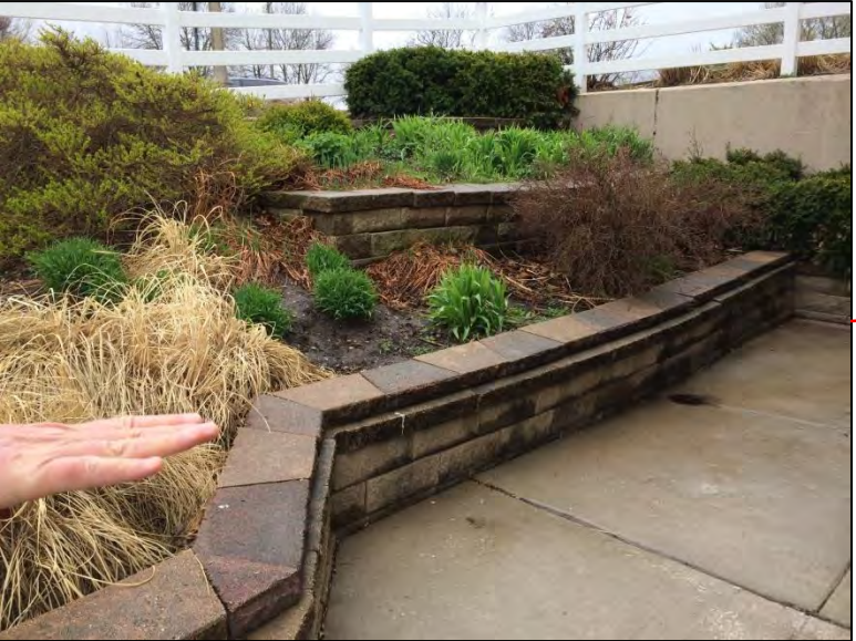
Failing retaining wall and drainage problem at small drain inlet near restrooms