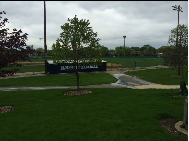
Ponded water and drainage concern behind Elmhurst College Baseball Field