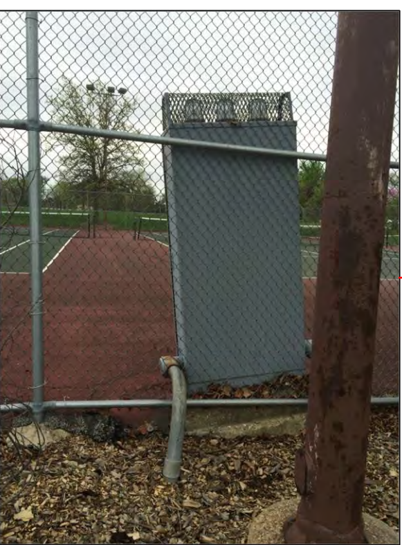
Failing Structure for Lighting Controls