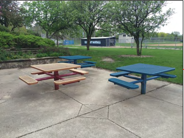
Table seating near Recreation Building