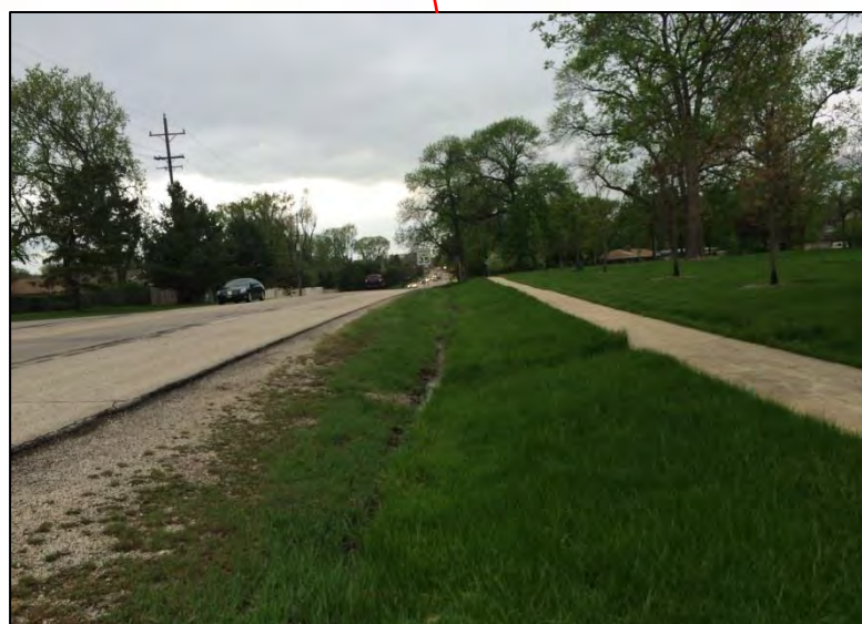
Butterfield Road near sidewalk