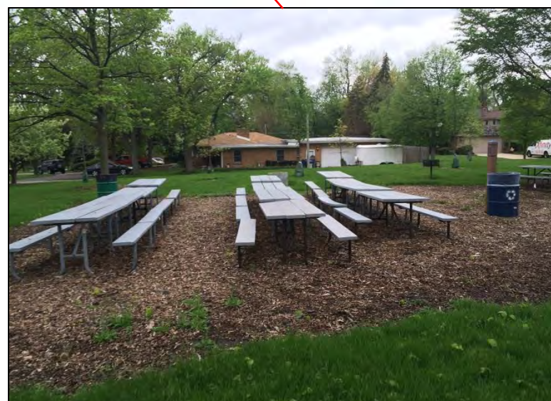
Open picnic rental area