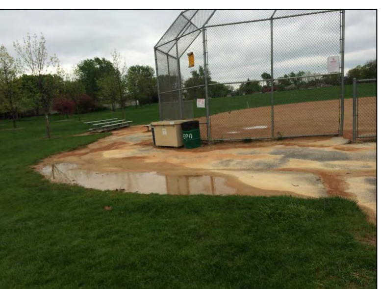
Ponded water behind baseball field