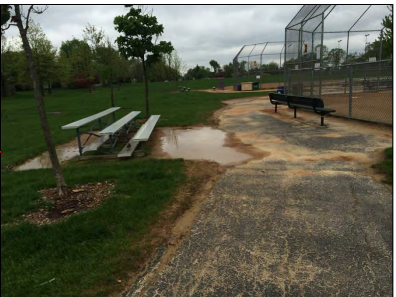
Ponded water at bleachers