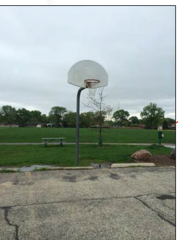
Basketball hoop in parking lot