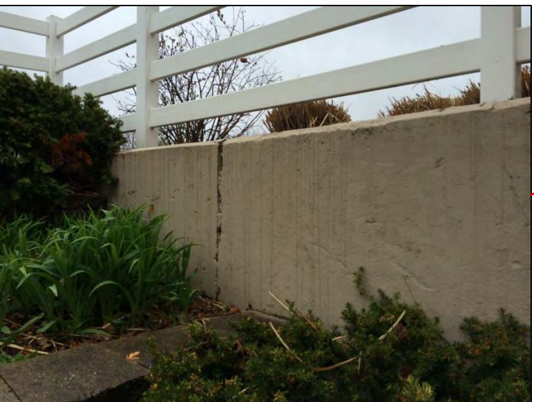
Cracking concrete retaining wall at parking lot above restrooms