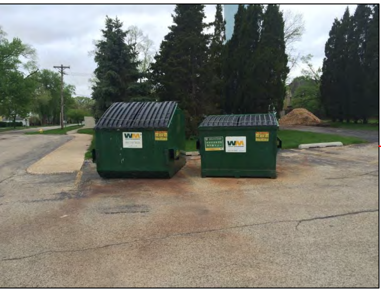
Unscreened garbage dumpsters