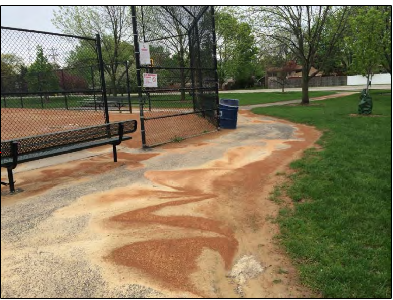
Field stone washing off baseball field