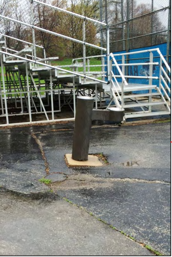
Failing foundation for drinking fountain