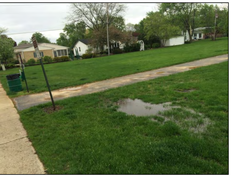
Ponded water at trail connection