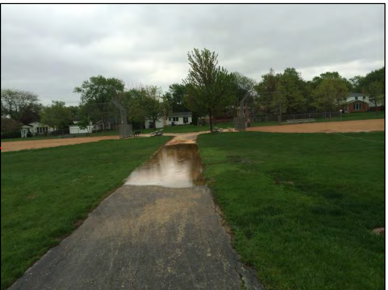
Ponded water on asphalt path