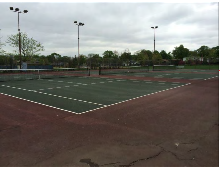
Tennis Courts in generally good condition