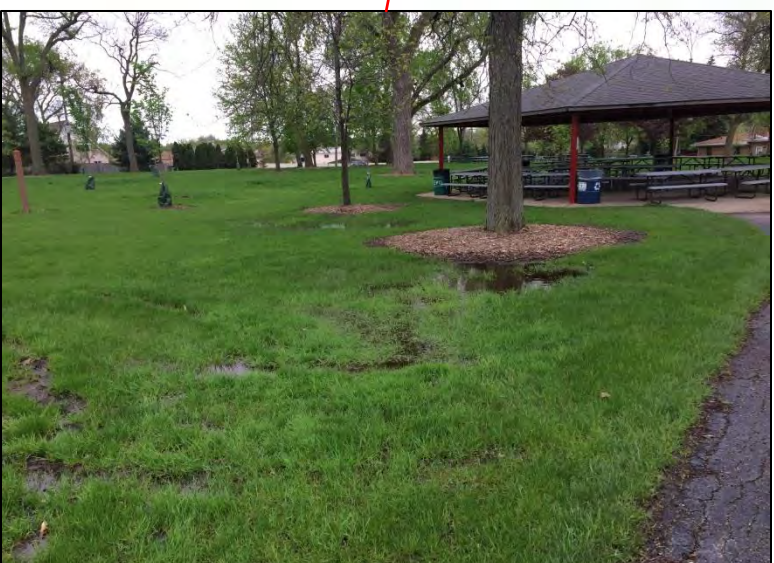
Ponded water near picnic structure