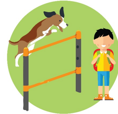
New Dog Park