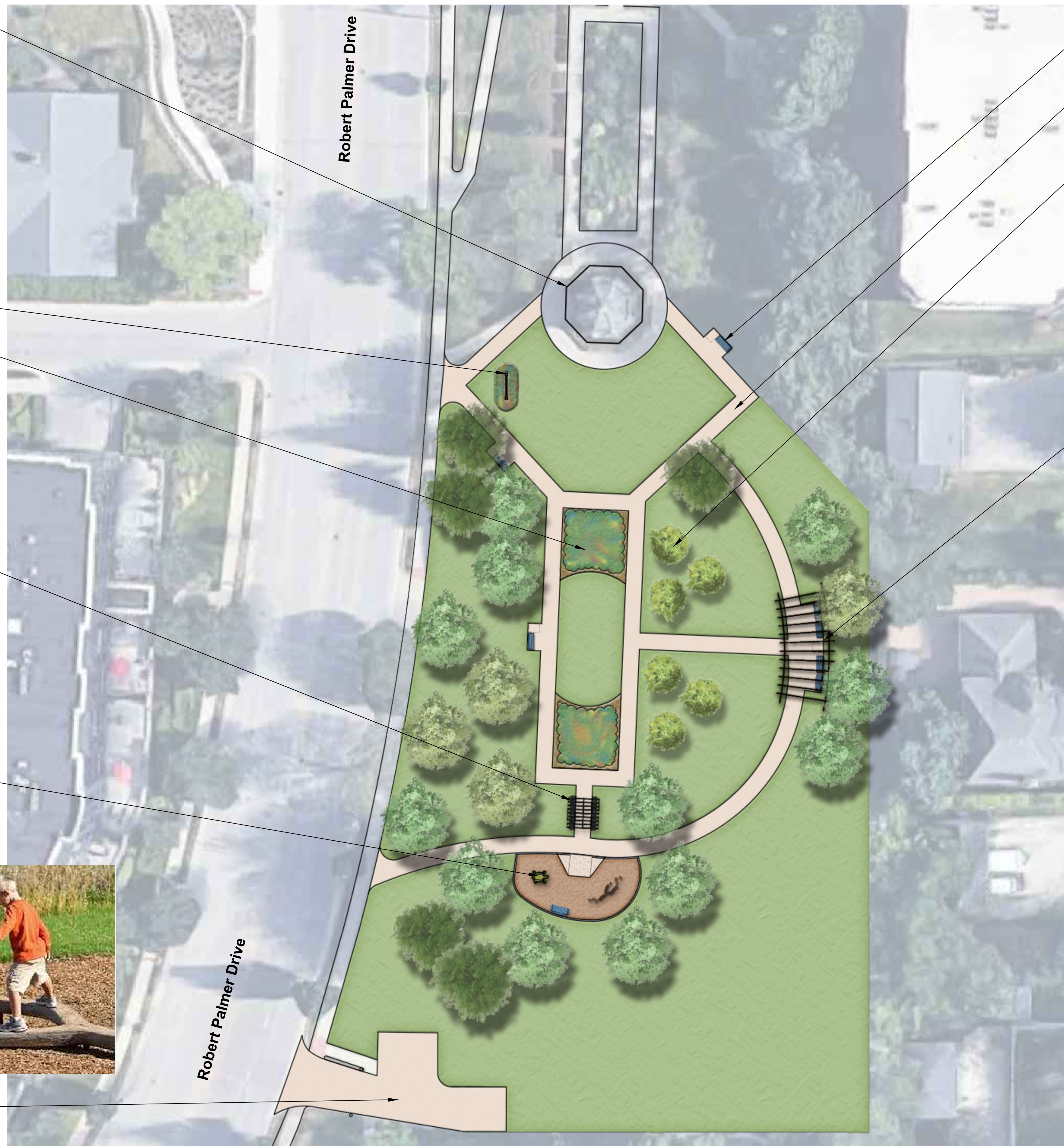
Bench Pad with Companion Seating