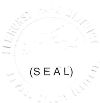
_____ Secretary, Board of Park Commissioners Elmhurst Park District

IN WITNESS WHEREOF , I hereunto affix my official signature and seal of said Park District at Elmhurst, Illinois, this 9th day of December 2024.